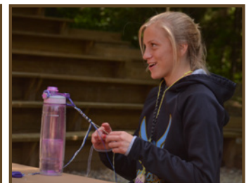
Above: Campers weave friendship bracelets during High School Camp.